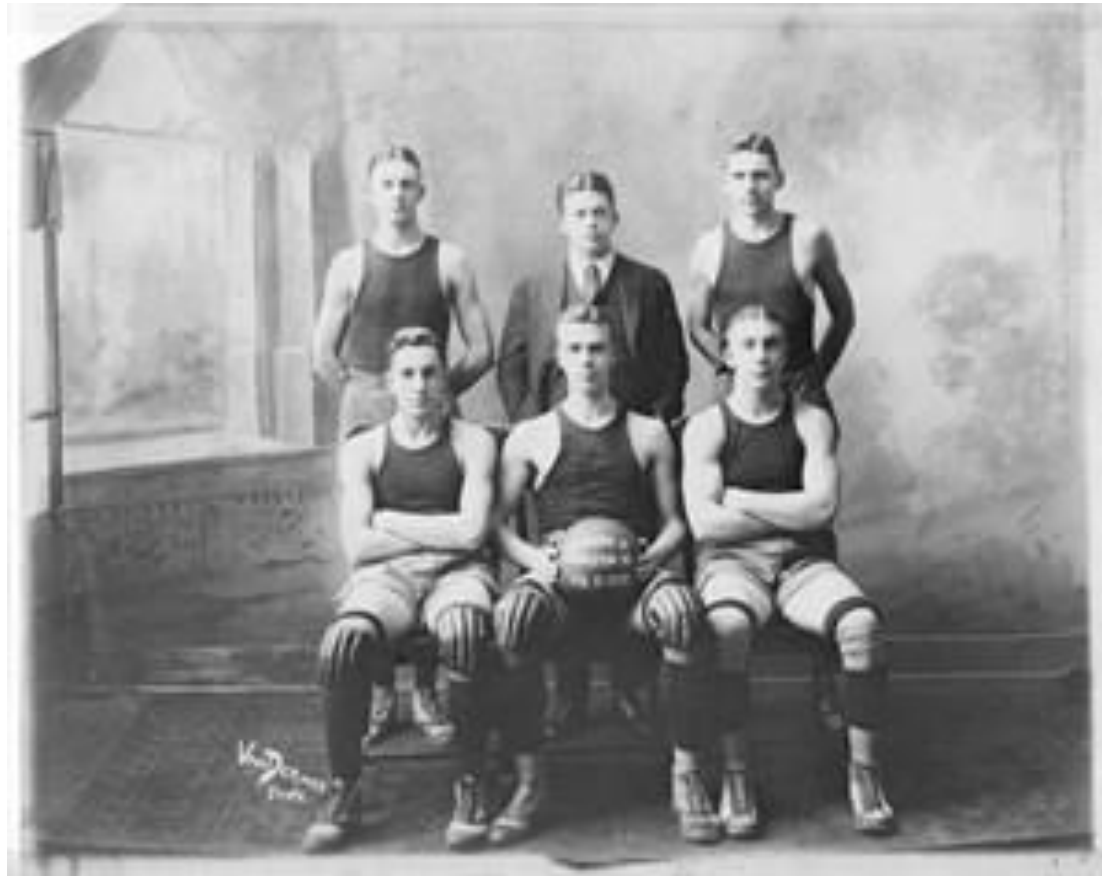
Rutgers Basketball Team, 1919-1920